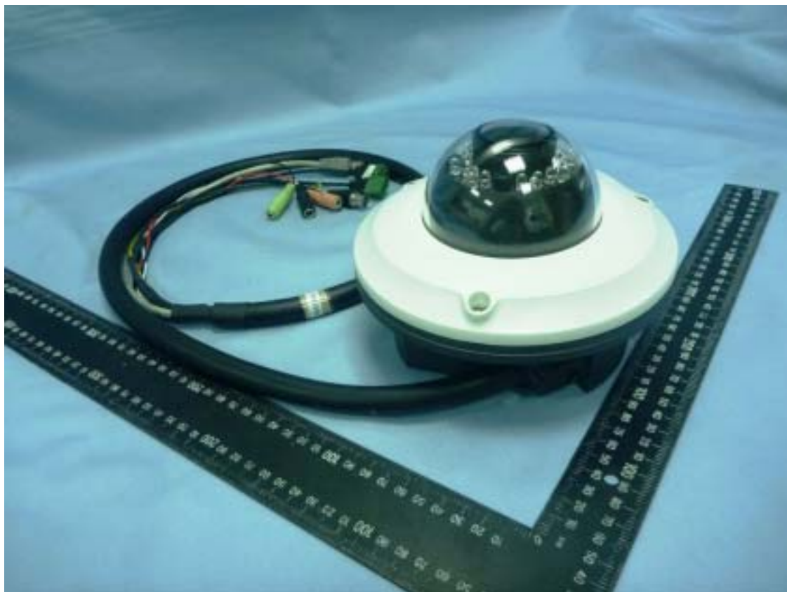
Photographs ID 3-01